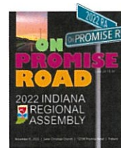
2022 Regional Assembly "On Promise Road"

The Disciples' Men's will meet on October 8th at 8:00 a.m. in the fellowship hall. All men of the church are welcome and if you like, please bring a brother, a friend, or a neighbor and come hungry.