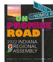
2022 Regional Assembly "On Promise Road"

The next regular Disciples' Men's meeting will be on October 8th at 8:00 a.m. in the fellowship hall. All men of the church are welcome and if you like, please bring a brother, a friend, or a neighbor.