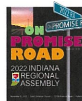
2022 Regional Assembly "On Promise Road"

The next regular Disciples' Men's meeting will be on October 8th at 8:00 a.m. in the fellowship hall. All men of the church are welcome and if you like, please bring a brother, a friend, or a neighbor.